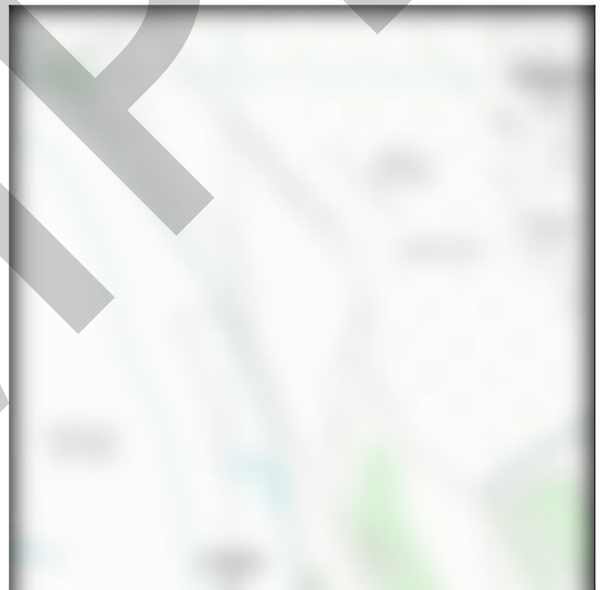
Approximate position of property